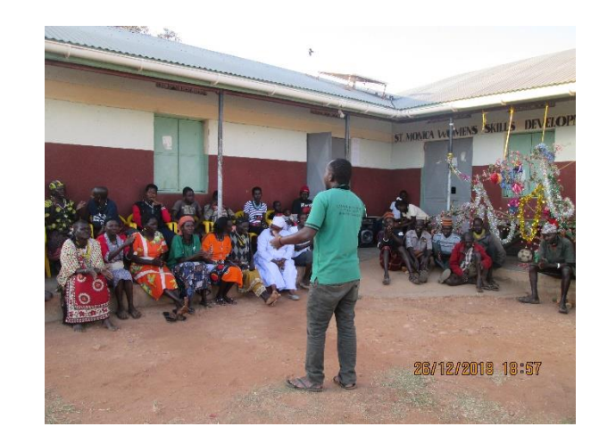
The members of St. Monica Women's group