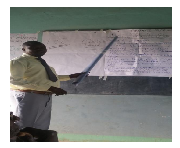
The photos above show how the training was conducted