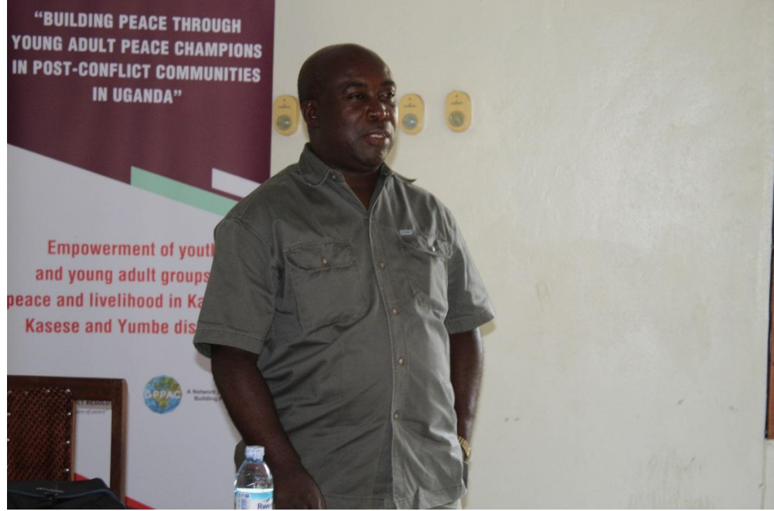
Assistant Resident District Commissioner – Kasese during official opening of the training in peacebuilding