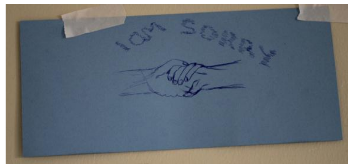
Drawing by a former child-soldier illustrating what he would like to see in his community ("my dream world")