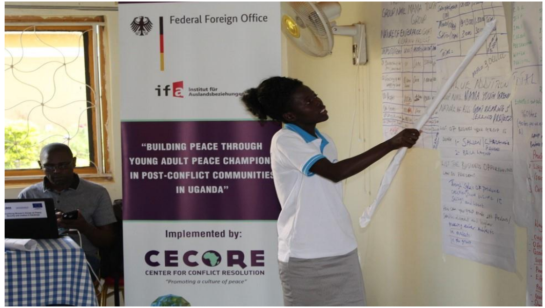
A youth group member presenting her group's action plan for a liguid soap-making project - Yumbe district