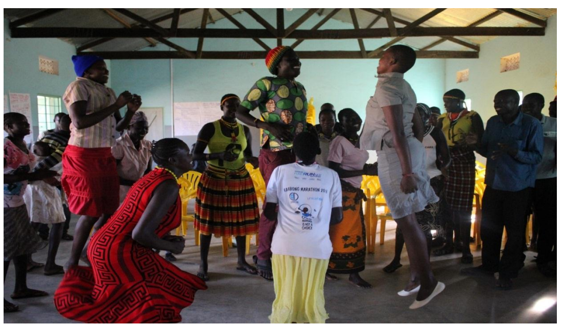
Young/adults/Youth in Kaabong in a traditional dance