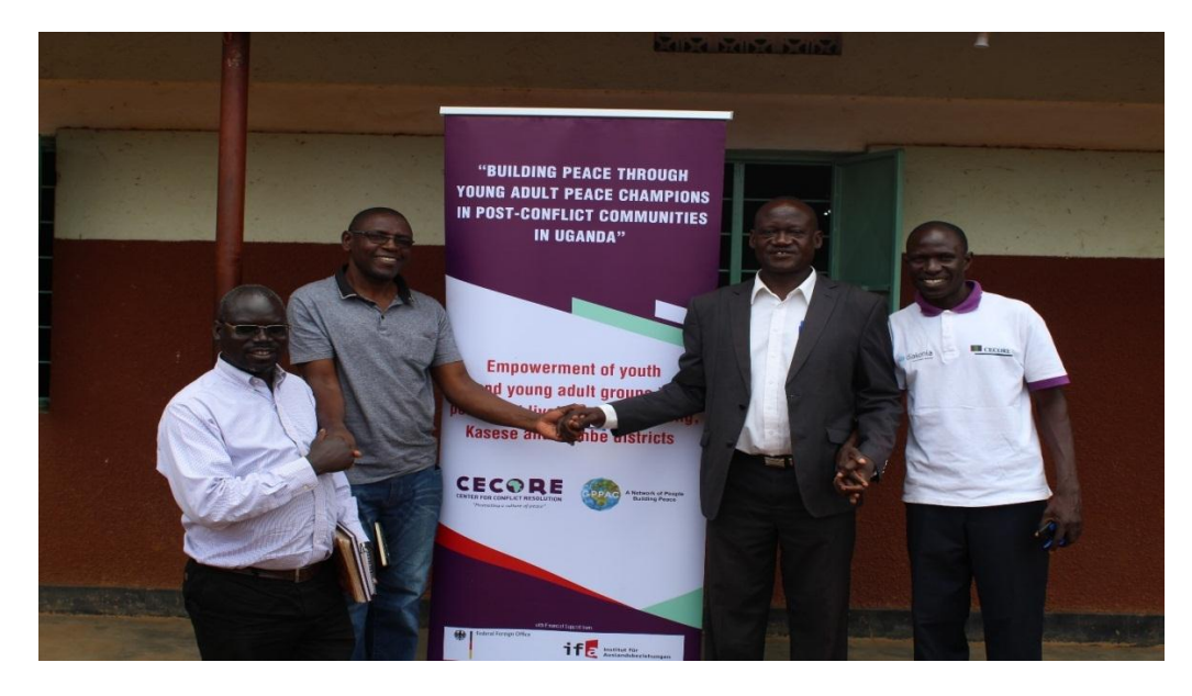
Resident District Commissioner - Kaabong district holding hands with CECORE staff as a sign of peace