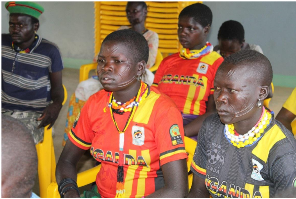
Young particpnats during a training in livelihood and income genertaing activoties – May 2019