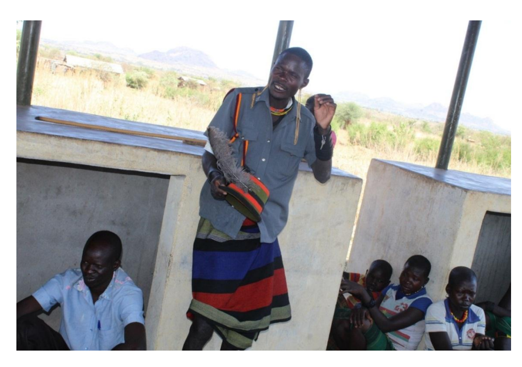
Youth in Sidok– Kaabong district in a Focus Group Discussion – March 2019.

Youth group in Kathile – Kaabong district performing a peace song for community peace sensitisation.