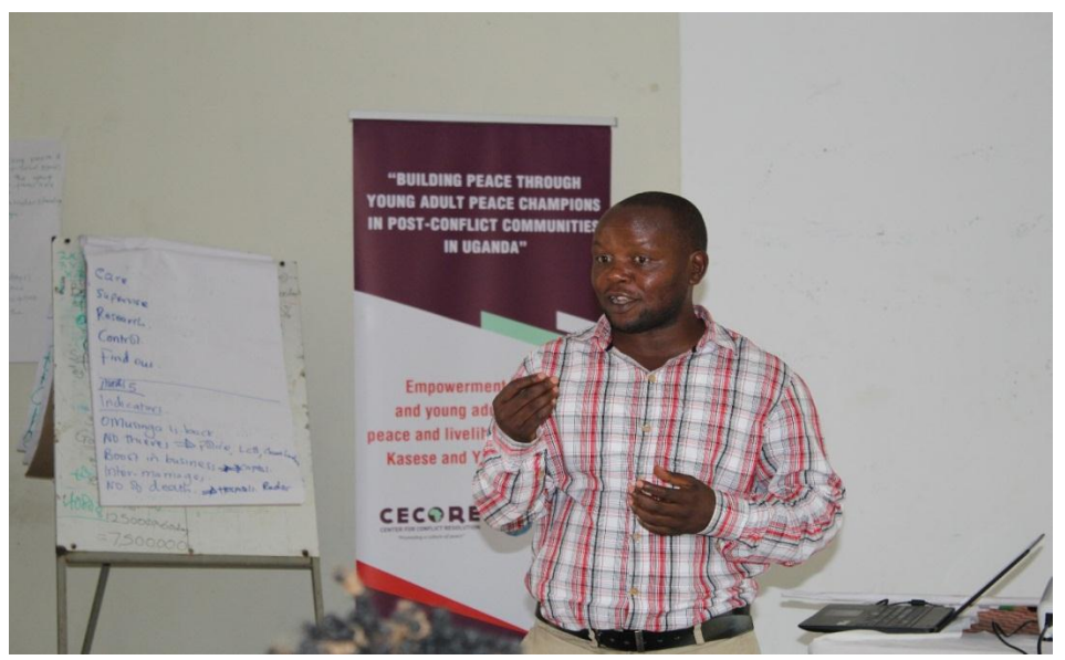
Chairperson LC5 giving closing remarks during the training in Kasese in peacebuiling