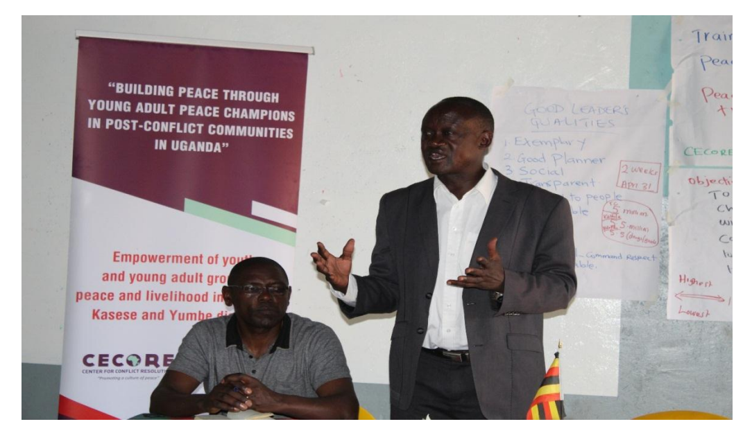
Resident District Commisioner - Kaabong District speaking to the peace champions

Maama youth group displaying some of the activities they are involved in.