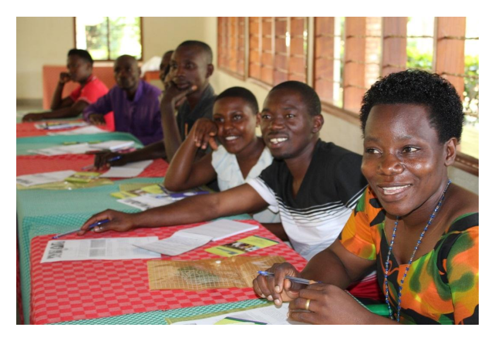
Youth and young adults during training in Kasese - April 2019