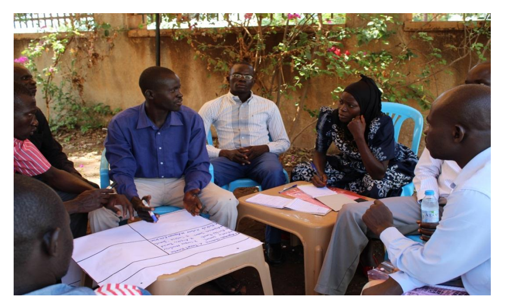
Participnats during a group session in Yumbe district during a training in peace building