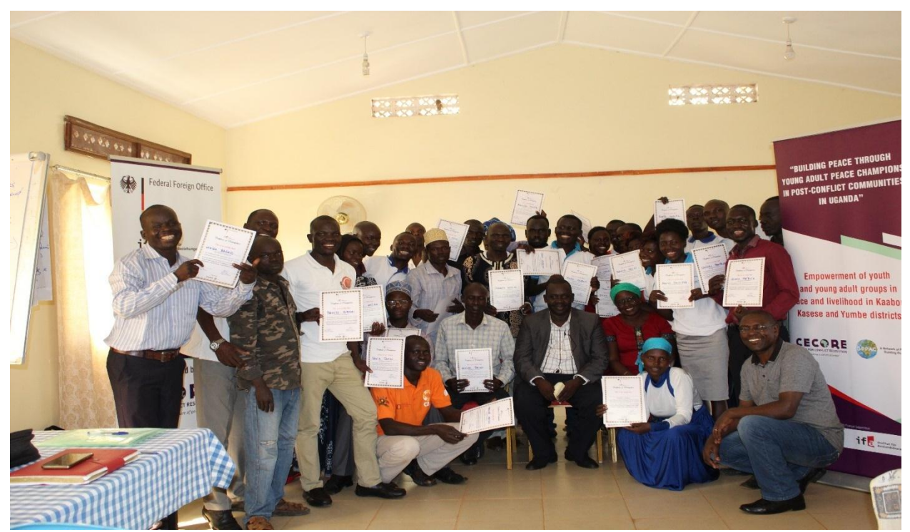
Group photo: Young adult/youth peace champions in Yumbe district after the trainings in peacebuilding and in livelihood.