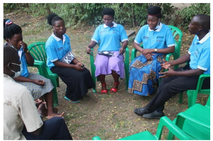
Some of the peace champions in Kasese during trainings