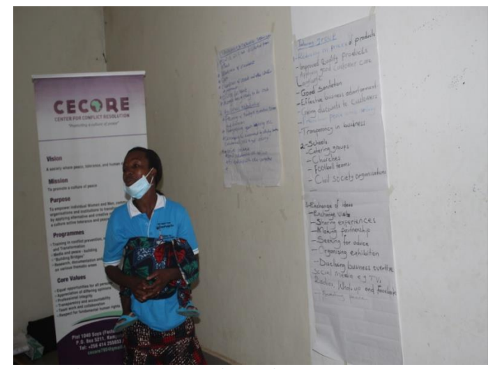
A peace champion presenting during plenary